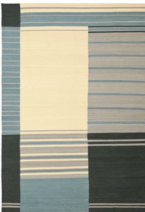
Karun Kilim Modernist - Beige/Blue 300x200cm