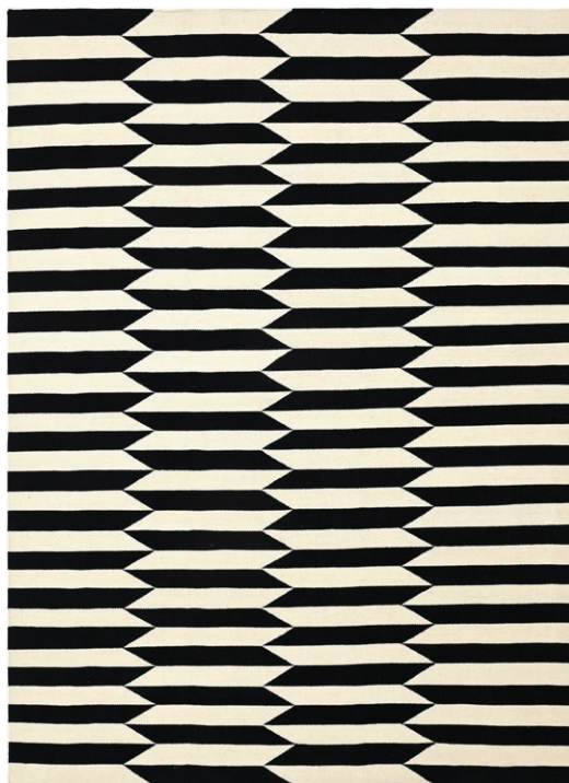
Karun Kilim Striped - Black