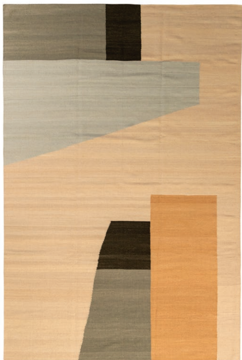
Karun Kilim Modernist - Beige/Multi 300x200cm