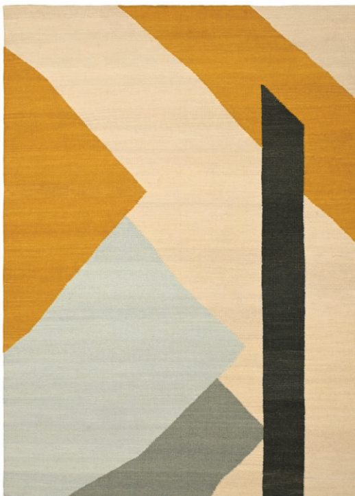
Karun Kilim Modernist - Beige/Multi 240x170cm