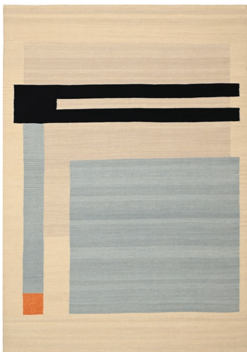
Karun Kilim Modernist - Beige/Blue 200x150cm