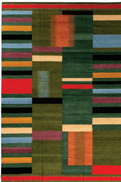
Karun Kilim Mazandaran - Multi 200x150cm