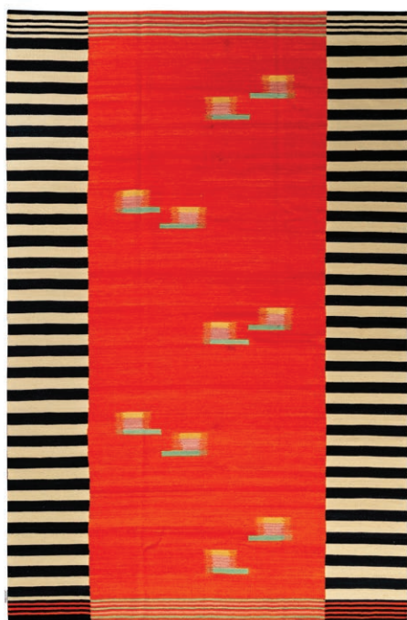
Karun Kilim Mazandaran - Black/Red 300x200cm