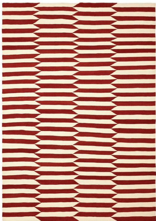
Karun Kilim Striped - Red