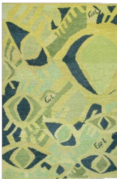
Green Hue 200x300cm