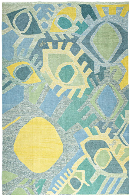
Yellow/Blue Multi 200x300cm