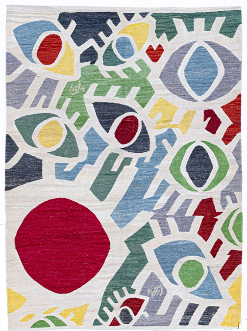
Multi Red 170x237cm